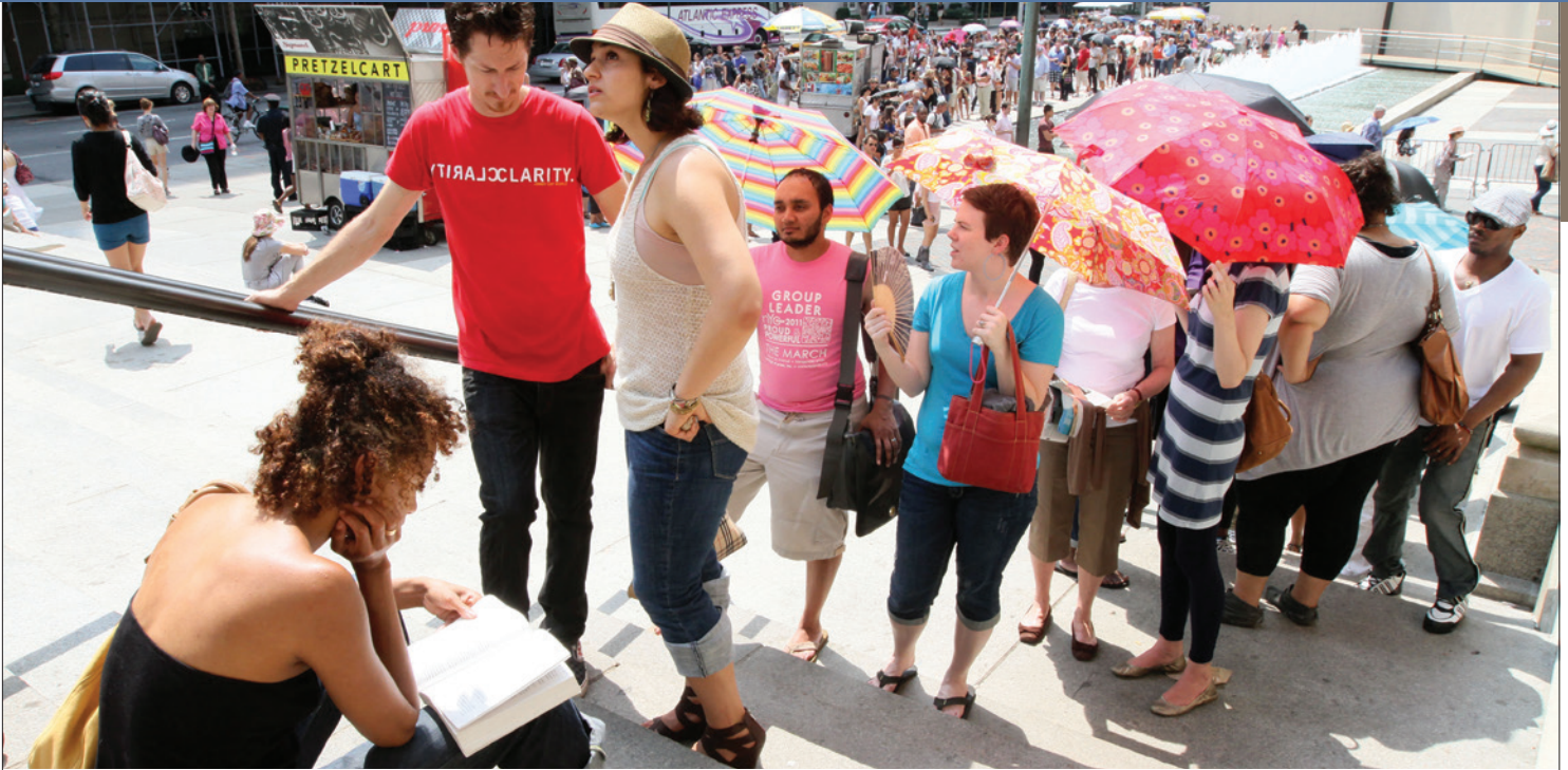
The line forms at the Metropolitan Museum of Art in New York.

“The majority of museums in the United States are nonprofits.”