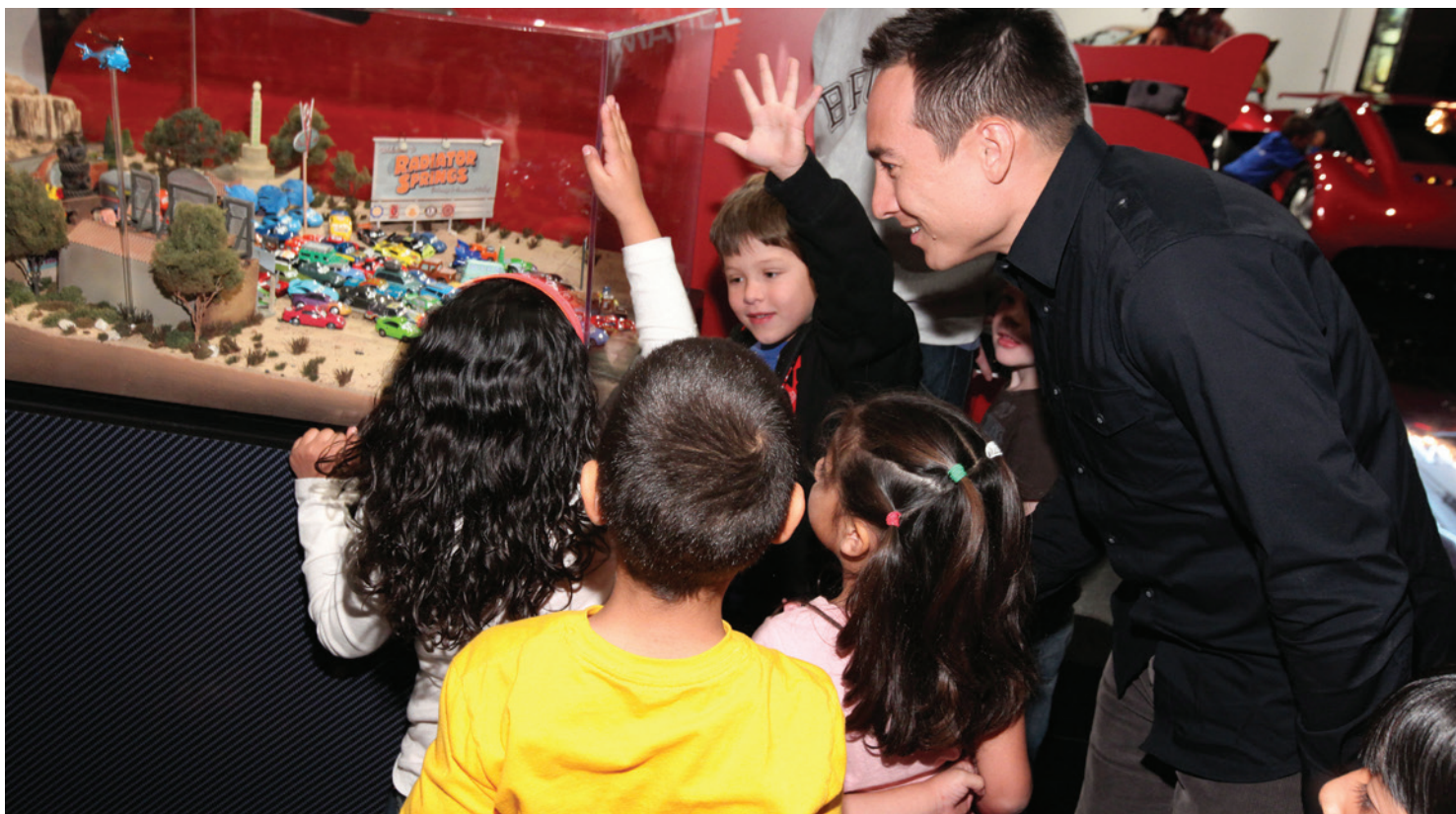
A Mattel designer explains a corporate-sponsored Cars exhibit at the Peterson Automotive Museum in Los Angeles.

revenue streams in order to sustain and grow their institutions.