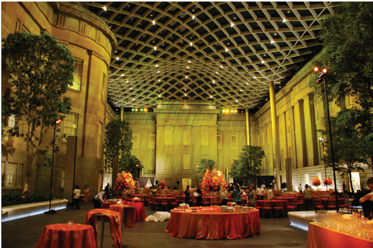
Washington's National Portrait Gallery's courtyard is rented for events. Adam Fagen

This segment of museum revenue also encompasses income from gift shops, bookstores and restaurants. A trend among American museums is to upgrade the offerings in these venues, with the goal of increasing revenue. A number of large U.S. institutions have added top-flight restaurants, some managed by notable chefs. The strategic approach behind these investments is to make the museum restaurant a destination in itself, thus helping to create additional community connections to the museum.