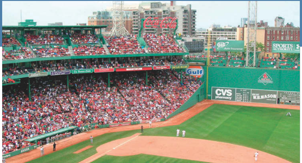
Boston's Fenway Park, the oldest U.S. professional sports venue

New England has cold winters, but Boston's coastal location makes its climate more moderate than inland areas. Its coldest month is January, when the average temperature is 29 degrees Fahrenheit (-2 degrees Celsius) and its hottest is July, which averages 73 degrees Fahrenheit (23 degrees Celsius). Bostonians see snow from December through March. Coastal storms, known as "nor'easters," produce much of the precipitation.